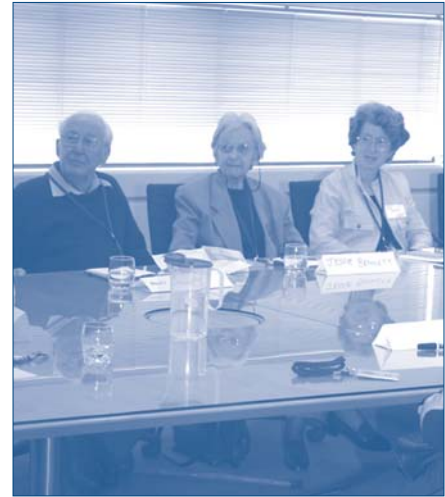
Pensioners discuss the CPI mail out package during a focus group at ComSuper

To be eligible, the spouse would have lived with a pensioner as their husband or wife on a permanent and bona fide domestic basis at the time the pensioner died and for three years before. The use of the words 'husband' and 'wife' in the legislation mean that same sex partners cannot be eligible spouses. The CSS Board may grant a spouse's pension even though the couple may not have lived together for three years if it considers that a permanent and bona fide domestic relationship existed. Evidence that may convince the Board includes the joint purchase of the home where the couple lived, a legal marriage between the couple, the birth or adoption of a child or the whole or substantial financial dependency of the remaining partner on the pensioner.