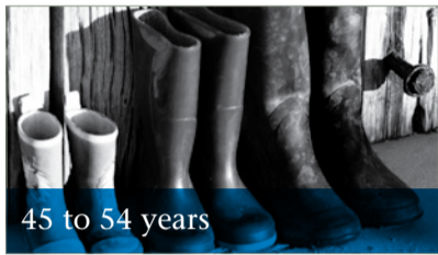
45 to 54 years

With retirement getting closer, you're probably starting to think more carefully about life after the workforce. Now is the time to make the smart choices that will help make your retirement years the best of your life.