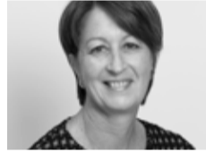
Winsome Hall Trustee (ACTU nominated) Appointed 1 July 1996, reappointed to 30 September 2010