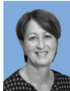
Winsome Hall Trustee (ACTU nominated) Appointed 1 July 1996, reappointed to 30 September 2013